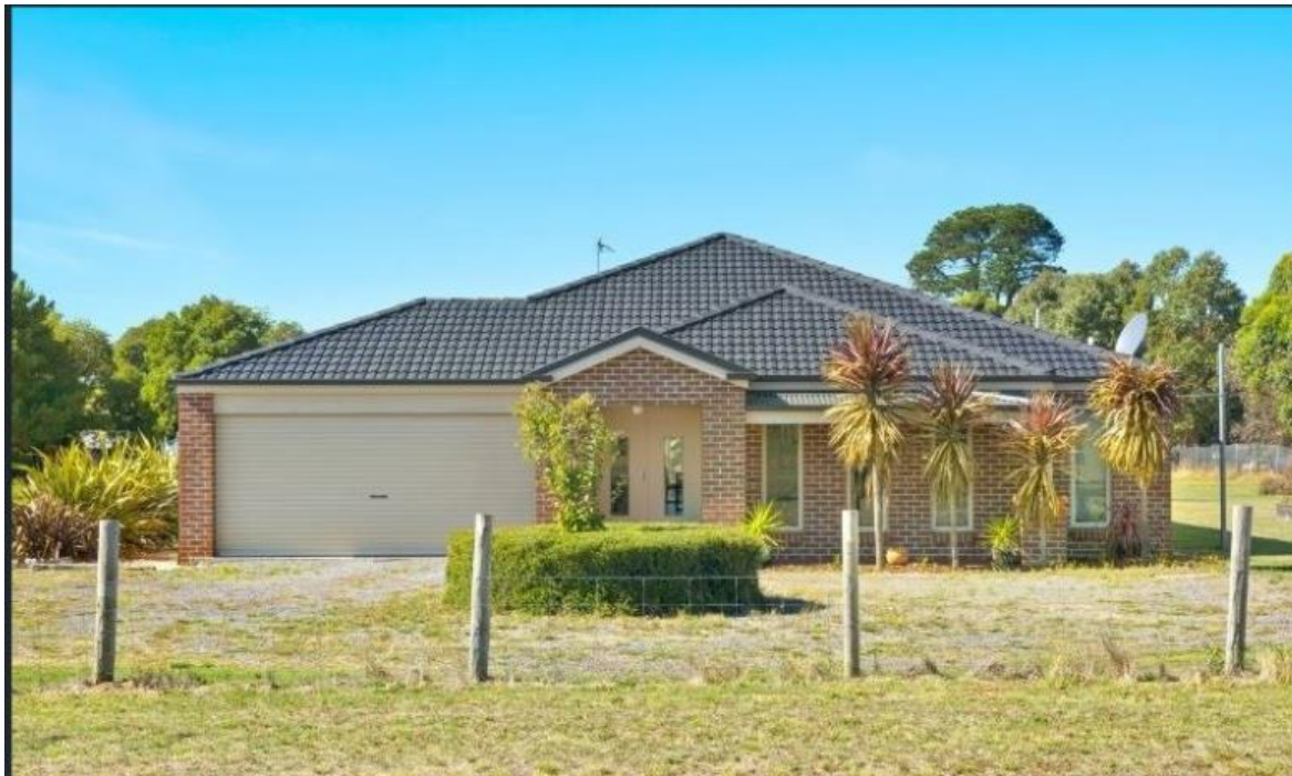
Photo of the new home at 85 Kimberly Drive, Waubra, Victoria