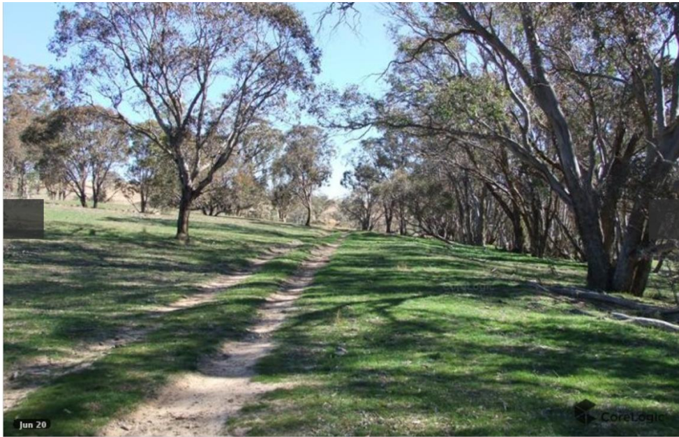
Photo of 1572 Carcoar Road, Carcoar, NSW 2791

Property C - Nominated in the report as a Rural property without a view of the wind farm.