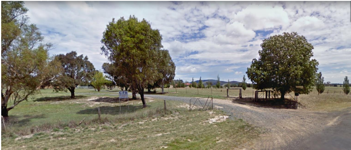
Property O - 329 Neville Road Neville, showing wind turbines in the background.