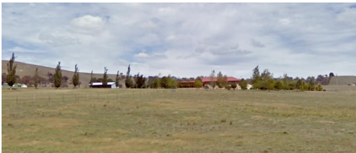
Photo of home at Property J - Neville Road, Neville