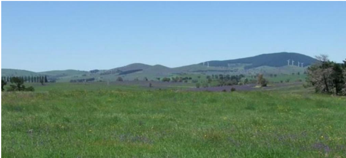
Photo of Property C - showing the wind turbines are clearly visible from the property.

Property D - Nominated in the report as a Rural property without a view of the wind farm.