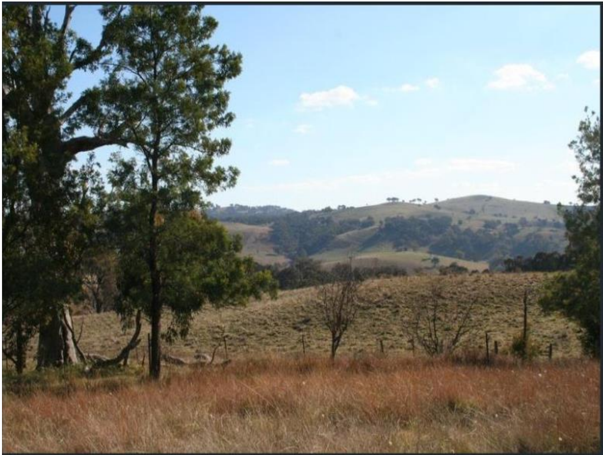
Property E - Nominated in the report as a Rural property without a view of the wind farm