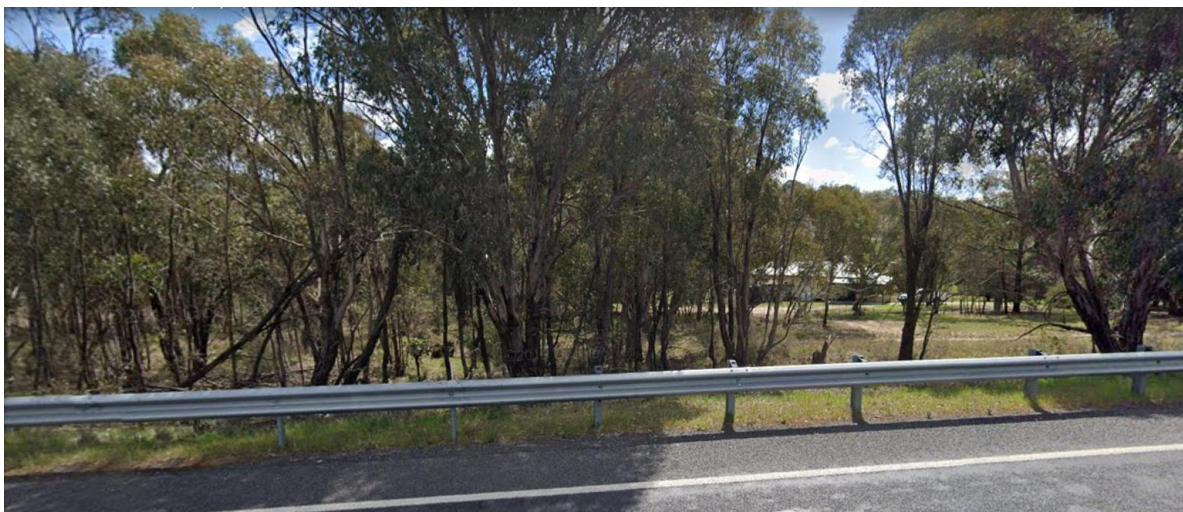
Photo of Property N - 4312 Mid-Western Highway house below road level