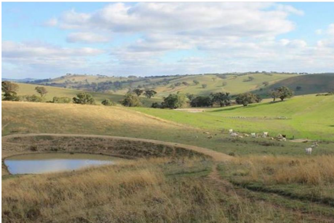
Photo of 1534 Carcoar Road, Carcoar