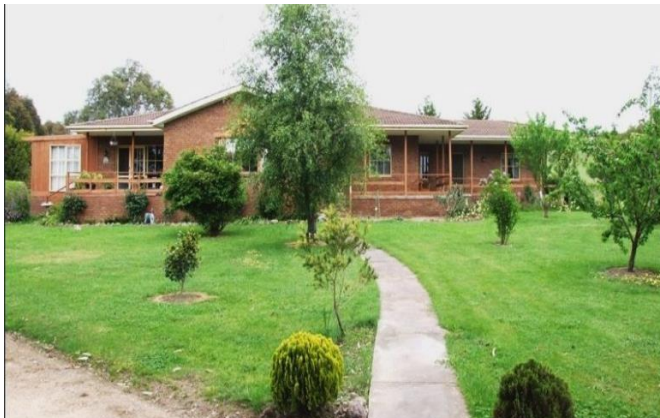
Photo of property 7 - 7 Troy Road, Waubra, Victoria

The value of the property has been significantly impacted by the presence of the wind farm.